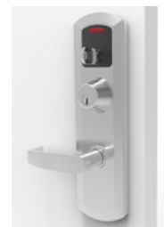
X-Sync Exit Device Trim