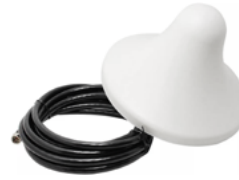
KX-915-009 Network Antenna