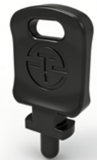
RFID Fob Credential