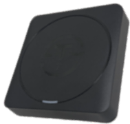
NE7 Network Encoder

TownSteel's AegisSync™ is a complete line of locks for every residential and community living application. Unit locks, suite locks, and common access locks can each store an audit trail of up to 2,000 entries.