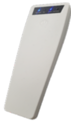
DLP7 Door Lock Programmer